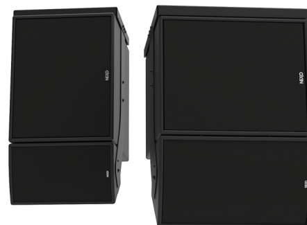
eLS600 coupled with ePS8 (left) and ePS10 (right).

The eLS600 shares the same phase response as other NEXO speakers, making it extremely easy to mix with other NEXO systems, or when used with any NEXO subs, without risk of comb filtering or requiring complex electronic adjustment.