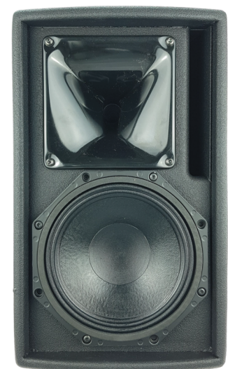
Grille removed, the large PS horn used with the HF driver

ePS8 acoustic phase response is NEXO phase signature allowing inter-operability between all NEXO speakers at all crossover points, except for the monitor setups where latency is minimized.