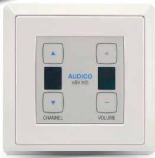
85x85 mm, installation depth 20mm The adjusting plate and frame are not included.

The ASV 800 is a device used for controlling the Audico Avec sound reproduction system. It is used for choosing wanted program source and its volume level. The properties of the panel are defined with the Avec configuration software. The panel is connected to the ADA 8x8 central unit with CAT 5/6/7 cable to the local or system bus. No other active devices or switches can be connected to the bus lane. Each panel has its own address set with the DIP switches. The panel gets its power from the central unit.