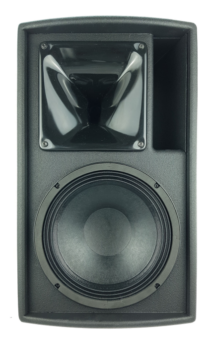
Grille removed, the large PS horn used with the HF driver

ePS12 acoustic phase response is NEXO phase signature allowing inter-operability between all NEXO speakers at all crossover points, except for the monitor setups where latency is minimized.